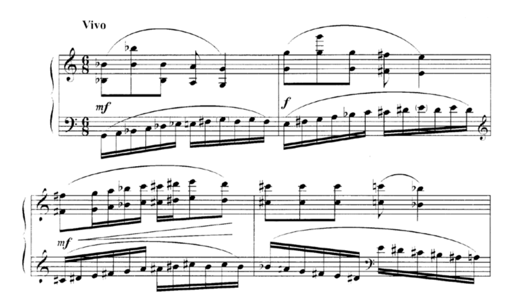
Ex. 1. Motule mano / Oh, My Dear Mother (VL 300, 1906)—octatonal mode

a deep interest in Lithuanian traditional songs throughout his creative life, treating traditional tunes as a foundation for Lithuanian professional music. The compositions of folk songs for piano became a laboratory for searching and testing new compositional tools, where the resulting solutions were soon manifested in original compositions. Čiurlionis presents more than 20 different ways of harmonizing folk melodies, using mainly modal, tonal, harmonic, polyphonic and textural means and their combinations, some compositional solutions, especially with the help of artificial modes, bitonal and polytonal modal and tonal structures—all extremely bold and original. He repeatedly returns to older harmonized examples and tries new tools and methods.