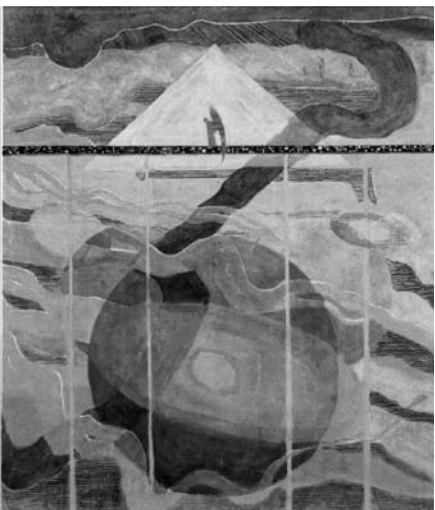
Ex. 5. Allegro and Andante from the Sonata of Stars (1908)