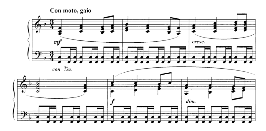
Ex. 3. Sėjau rūtą / Sowed the Rue (VL 179, 1900)—simple contrapuntal accompaniment