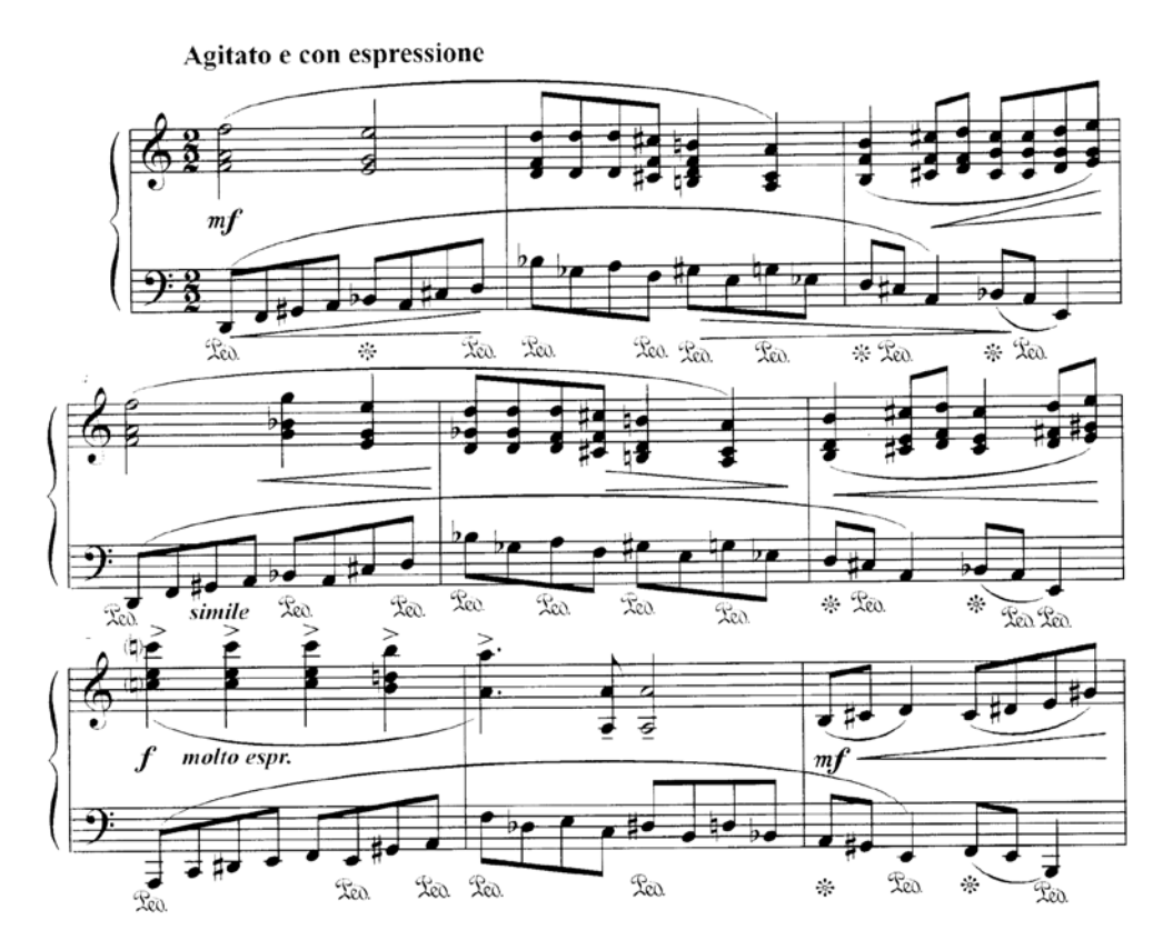
Ex. 2. Motule mano /Oh, My Dear Mother (VL 340, 1909)—motivic development