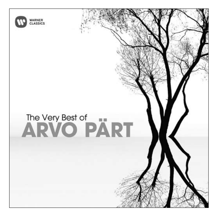
Example 2. Arboreal symbols and symmetry in the artwork accompanying Pärt's music

In a sketch Arvo Pärt drew in 1995—reproduced in several books, most notably on the front cover of The Cambridge Companion to Arvo Pärt (2012)—he graphically described a number of his works. In this sketch, Tabula rasa , for instance, is presented as a spiral circle, and Arbos (1986/2001) as a fractal tree. In addition to Pärt's self-commentaries, mythologems appear in the visual media accompanying his music. Images of a (typically leafless) tree have been used on the booklet covers of the CDs featuring Pärt's Te Deum and The Deer's Cry (both released by ECM New Series), Da Pacem (Harmonia Mundi), and The Very Best of Arvo Pärt (Warner Classics). The latter is organized symmetrically (E.g. 2), as the image of the leafless tree is combined with its reflection, thus underlining its double mythological function ("a ladder stretching up to heaven and downwards to the underworld").