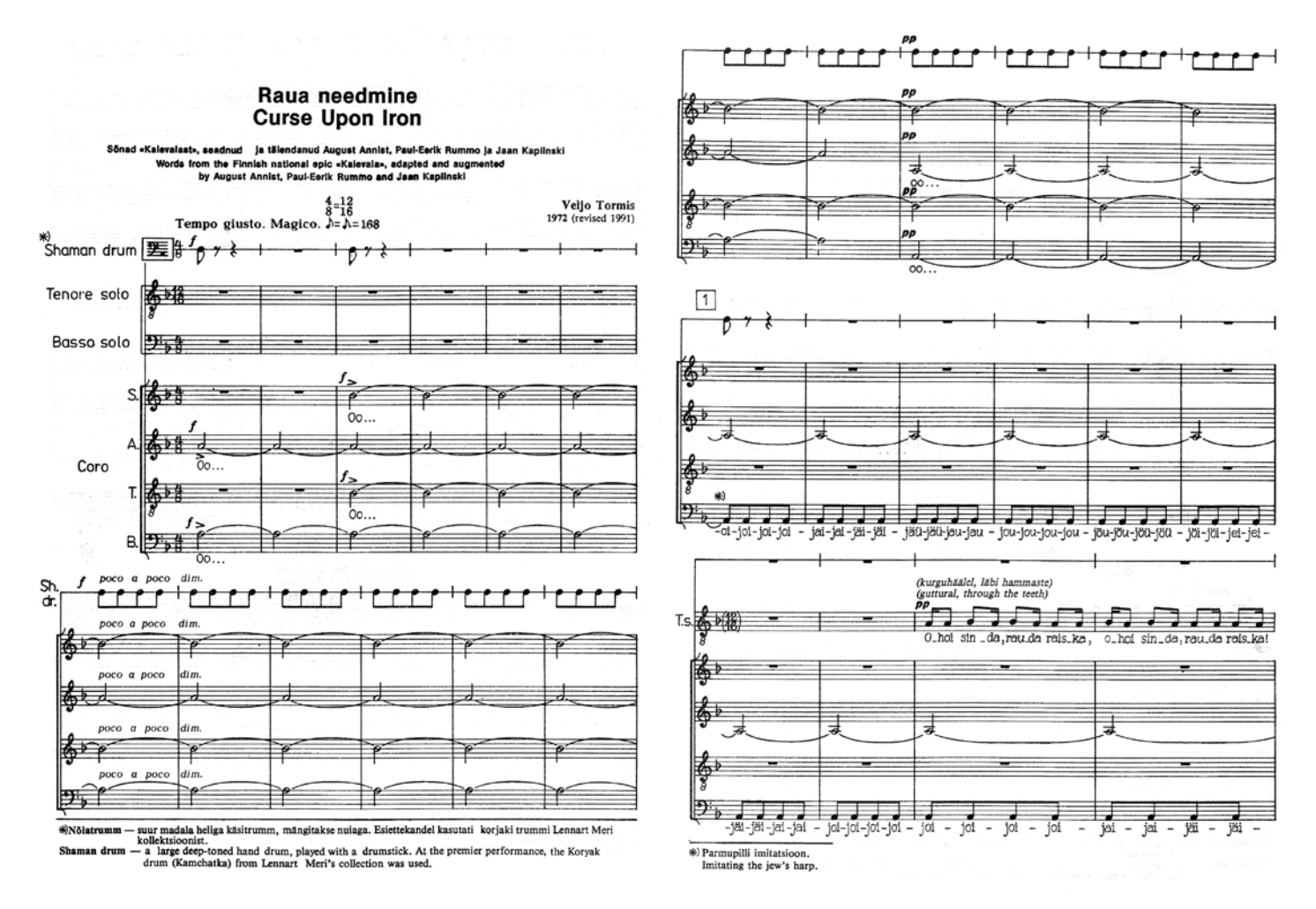
Example 4. The beats of the shaman drum and onomatopoeic syllables at the outset of Tormis's Curse Upon Iron

Mythification in Curse Upon Iron, however, is not limited to the visions of the past. The text, derived from the Finnish epic Kalevala, Canto IX (The Origin of Iron), is complemented by the contemporary allusions by Paul-Eerik Rummo and Jaan Kaplinski, thus transforming the shamanistic experience into an allegory of doom in modern (nuclear) warfare: "New eras. New gods and heroes. And cannons and airplanes and tanks and [machine] guns. Brand-new and up-to-date technology ... harm and hurt, cause unknowable loss, and kill, kill with iron and with steel, with chromium, titanium, uranium, plutonium, and with a multitude of other elements."