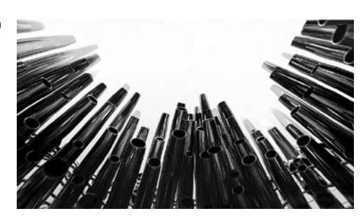
Example 1. Images from Rimas Sakalauskas's video clip for Last Pagan Rites : a) concentric circles hovering over the forest; b) ascending organ pipes