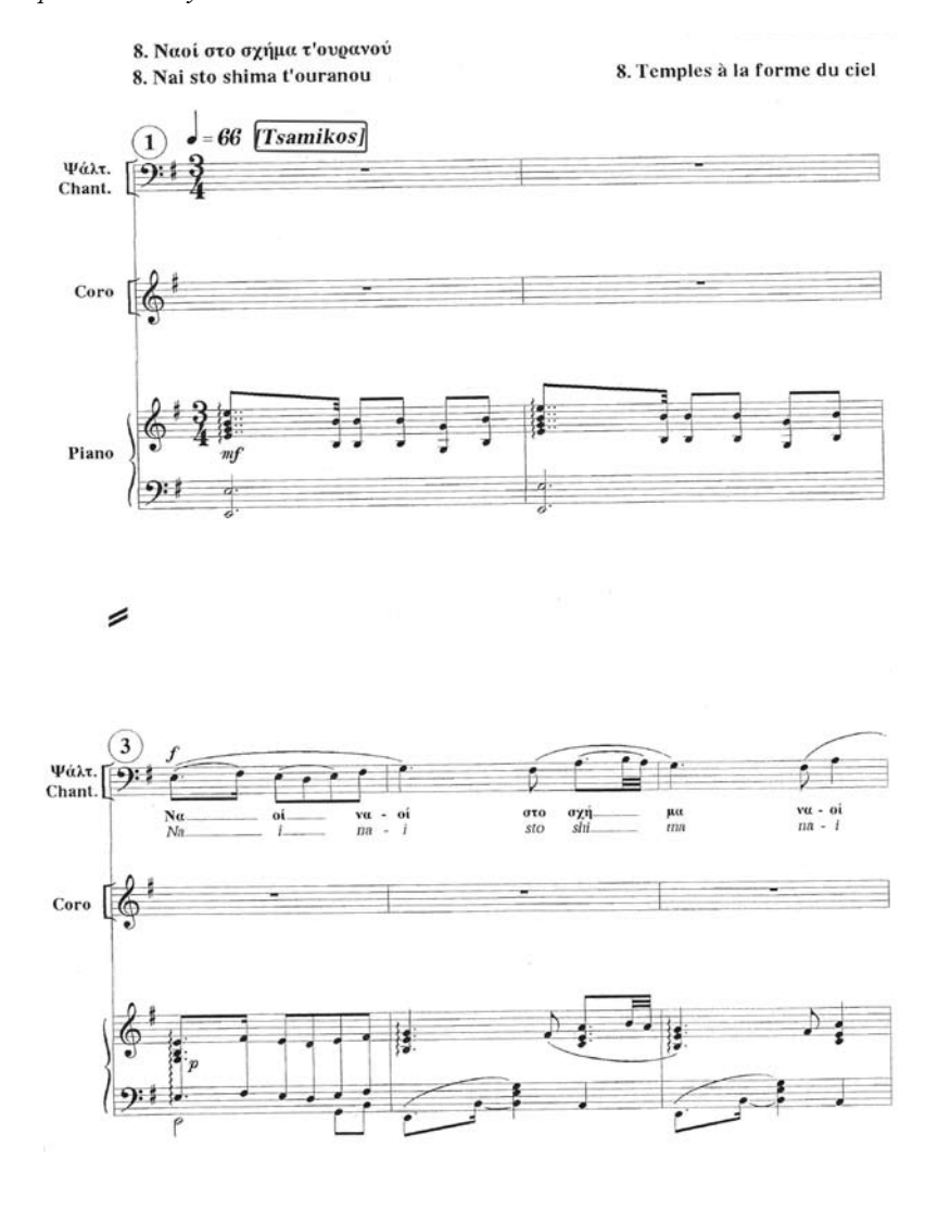
Example 3. "Temples with the sky's scheme"