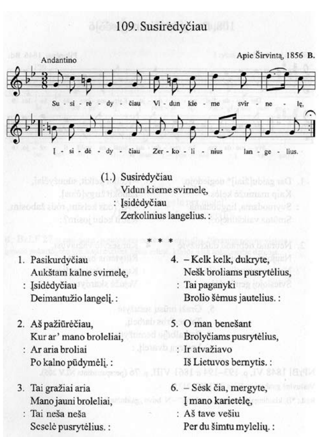
Song No. 109 in new edition, Vilnius, 2000

But if we could do an experiment and to take off those becars we could find that the same tune fully coincide with the big family of tunes that are spread in Southern Lithuania.