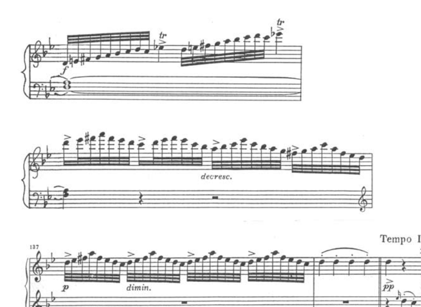
Example 3. Ferenz Liszt: Die Drei Zigeuner, piano introduction